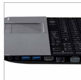
Wide selection of fast connections