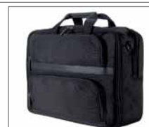
Advantage Laptop Case Pro 40.6cm (16'')