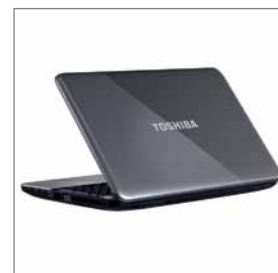
New business class design

The Satellite Pro L850 is a series of full-featured laptops for businesses who want great value, reliability and choice. There is a wide range of configurations available. You choose from the latest generation processors, graphics and memory sizes. Business class comforts include the non-reflective display, HD Webcam, SRS Premium sound and tile keyboard. Gigabit LAN, Bluetooth 4.0, HDMI and USB 3.0 provide the fast, modern connections business professionals need to stay productive. All this is topped off with famous Toshiba reliability for a long lifetime and low service costs.