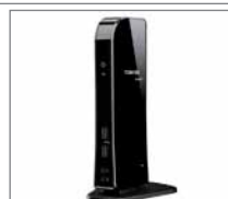
dynadock® U3.0 - Black