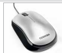
Toshiba USB Optical Mouse E200